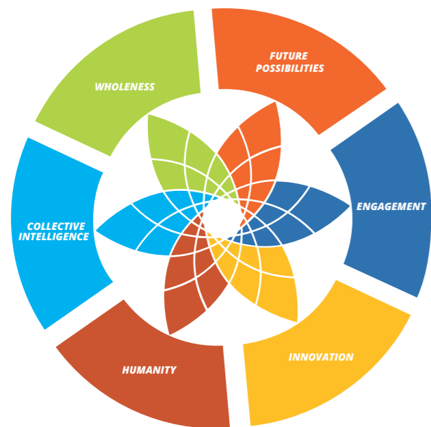
The Collective Leadership Compass © Copyright Petra Kuenkel

Our core approach is building functioning collaboration ecosystems by creating a culture of collective leadership. Our methodologies, based on our Collective Leadership Compass , focus on invigorating human interaction and networks to drive transition processes and help plan, enact and assess collaborative change. They strengthen individual leadership, enhance the leadership capacity of a collective and shift organisations or systems of collaborating actors towards better co-creation.